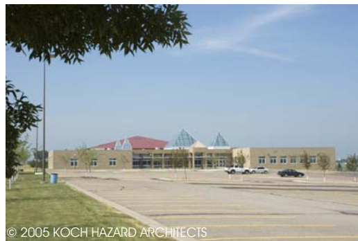
VIEW FROM SOUTH

At night, the new glass pyramids (complementing the original red pyramids) become lighted beacons for the STI campus. They are very visible from I-29.