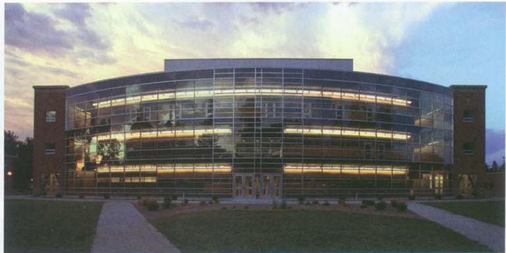
NORTH EXTERIOR VIEW

The new technology center is an addition to an existing three-floor, U-shaped building located on the campus of Northern State University in Aberdeen, SD. The addition, located at the end of the formal campus quadrangle, provides both a literal and a mission-based focus for the university.